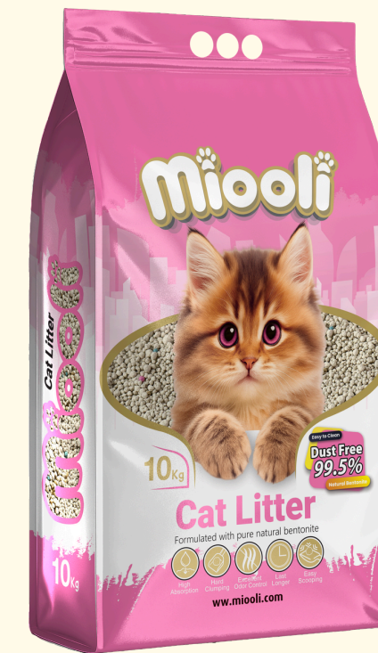
baby powder scent